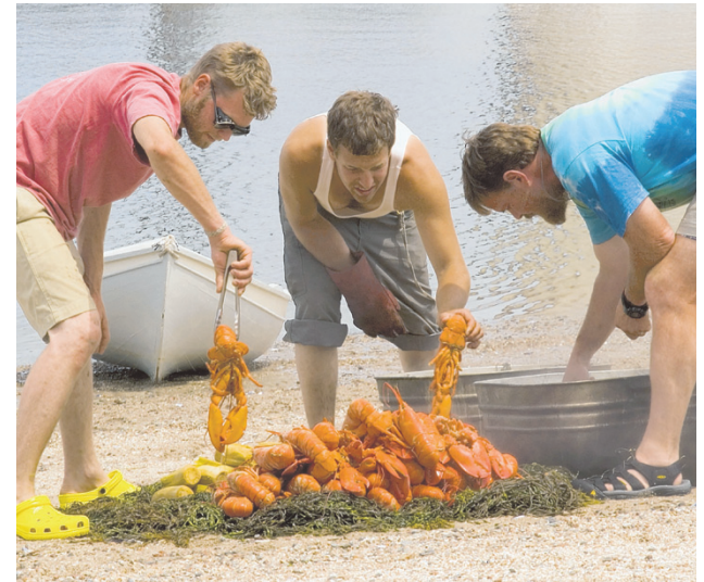
ROCK LOBSTERS: Crew members pile up lobsters for a windjammer excursion lobster bake.

on the lido deck, but you also won't have to put on a jacket and tie for dinner. Guests are often awakened by the smell of coffee and fresh-baked muffins, prepared right on board. It's small-scale dining prepared using fresh, local ingredients. Most boats source locally, working with CSAs when items like blueberries and strawberries come into season, and everything is cooked from scratch. There are no modern appliances, so ice cream is cranked out by hand, bread is kneaded by hand and meals are often cooked on a wood-fired, cast-iron stove.